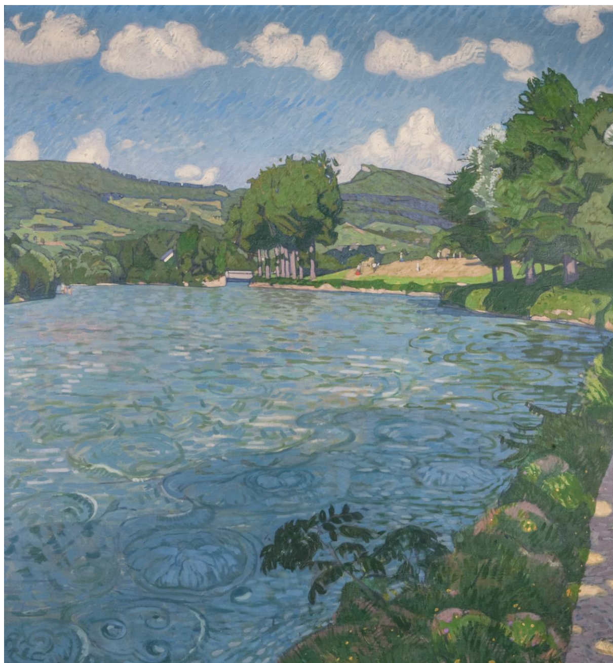
The river Aare is flowing lively through Otto Wyler's «River landscape» (1909). © Estate of Otto Wyler